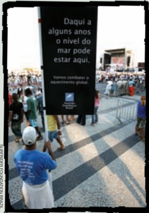
SURFRIDER FOUNDATION BRAZIL

Translation: In the future the sea level could be here. Fight Global Warming.